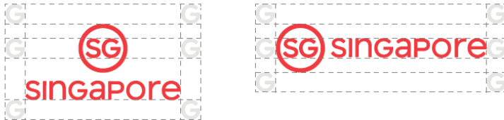
Fig. 1: Clear space